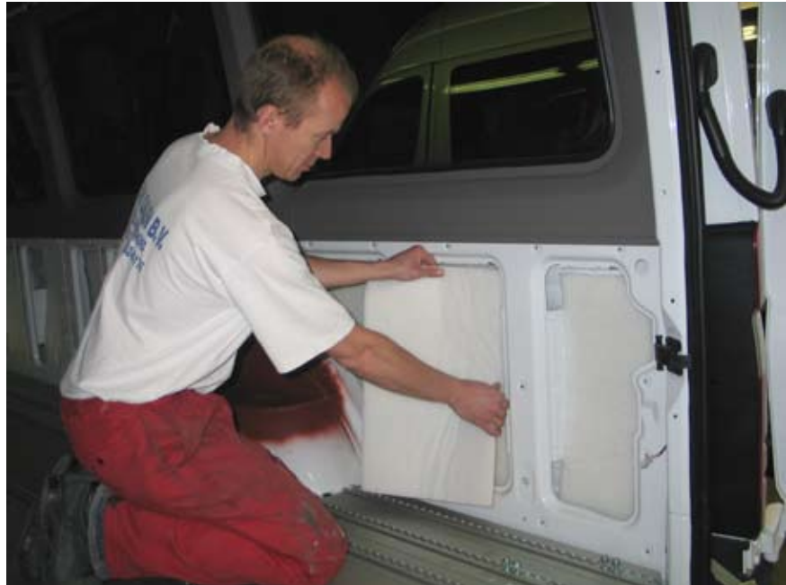
Akothem in a van

Akothem is resistant to temperatures from -30 °C to 120 °C